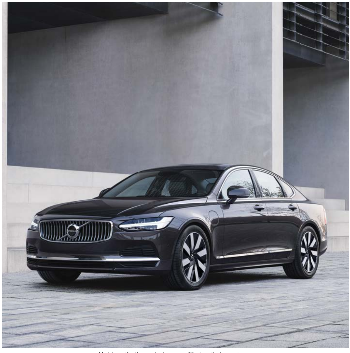
\label{thm:model} \mbox{Model specifications and colours may differ from the image shown.}