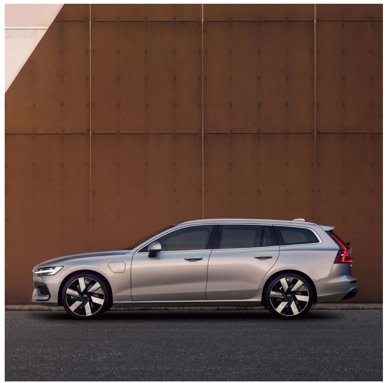
\label{thm:model} \mbox{Model specifications and colours may differ from the image shown.}