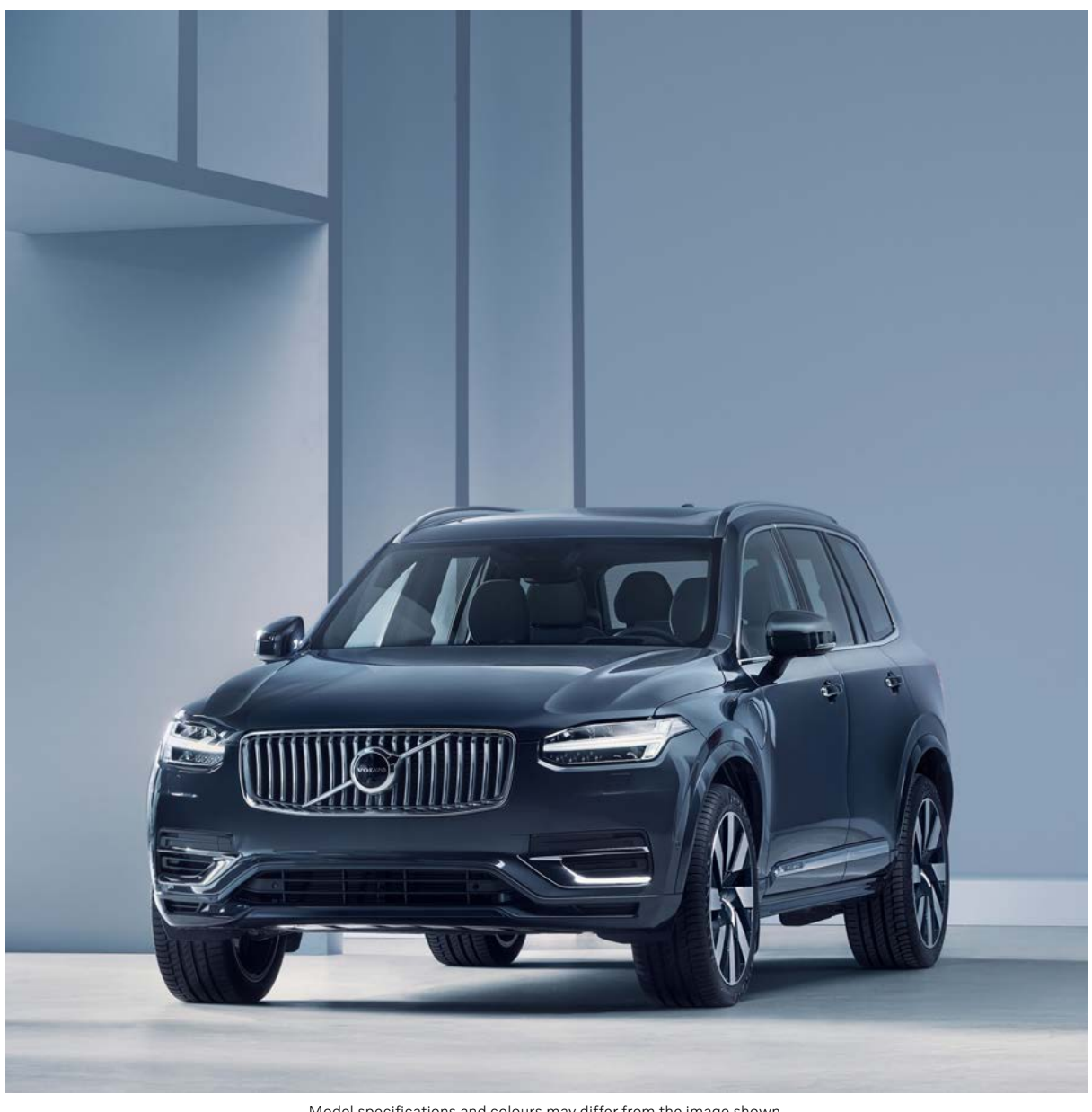
\label{lem:model} \mbox{Model specifications and colours may differ from the image shown.}